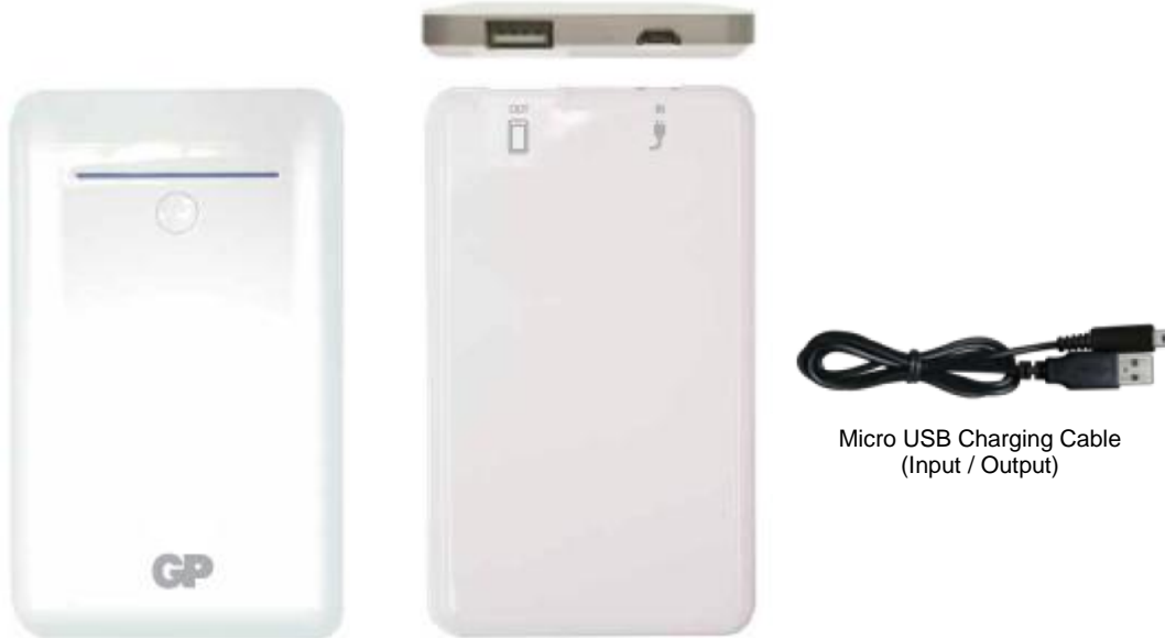
Micro USB Charging Cable (Input / Output)